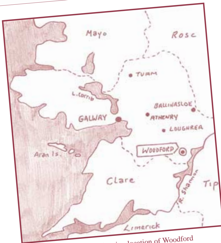
Figure 1. Map showing location of Woodford